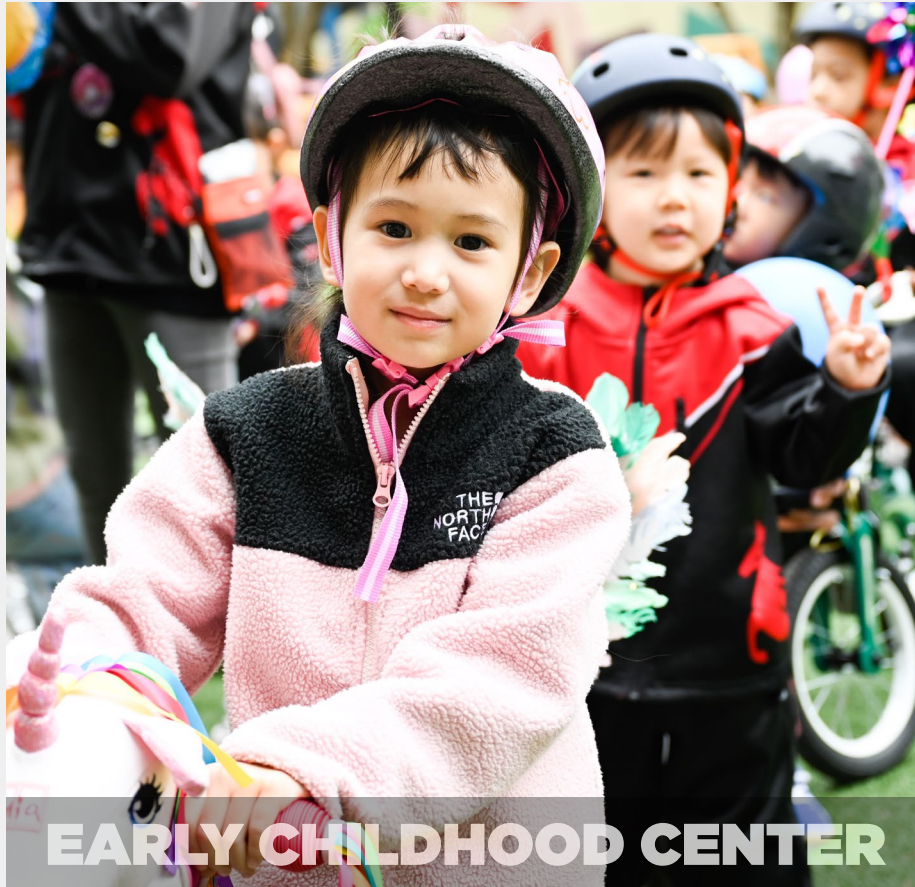
EARLY CHILDHOOD CENTER

Learning and teaching is intentional, concept-based, agentic, and cross-disciplinary to foster critical and creative thinking.