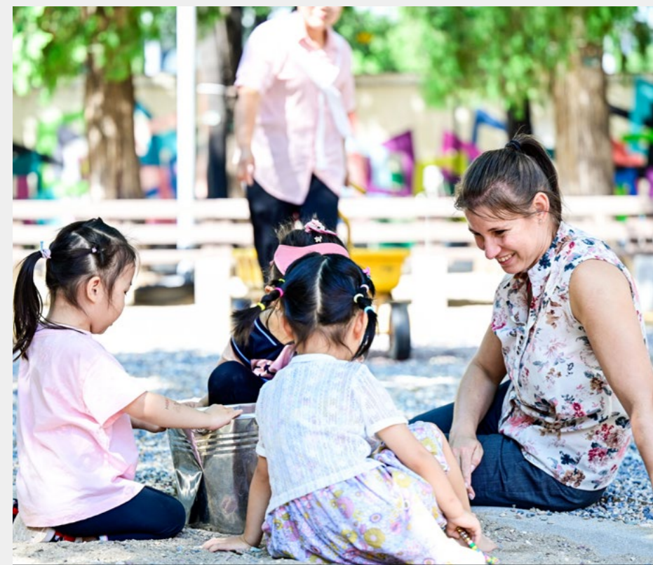
EARLY CHILDHOOD CENTER

Empower Learning and teaching is intentional, concept-based, agentic, and cross-disciplinary to foster critical and creative thinking.